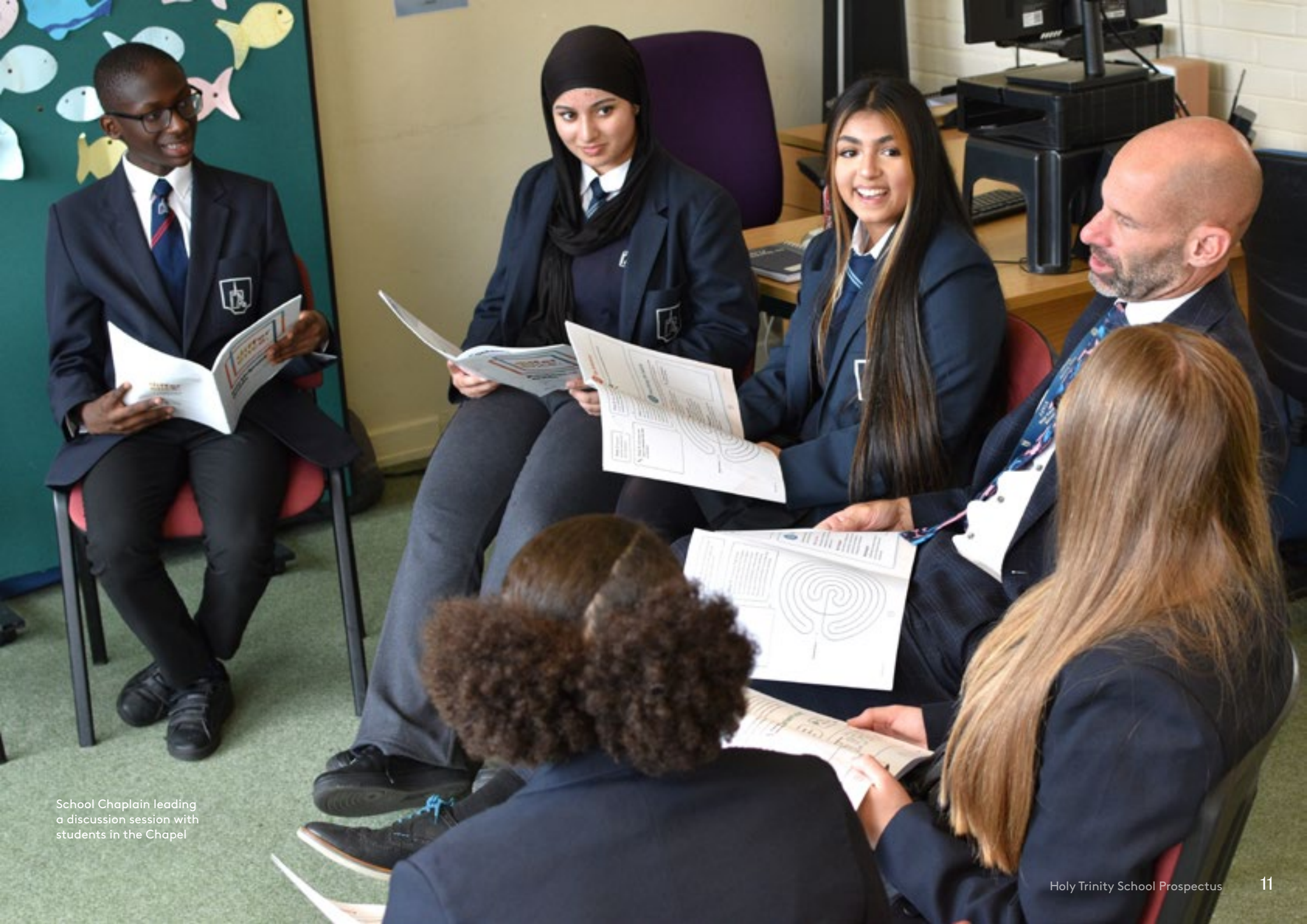
School Chaplain leading a discussion session with students in the Chapel